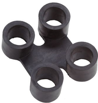
563K Sanitop Deluxe™ Connector