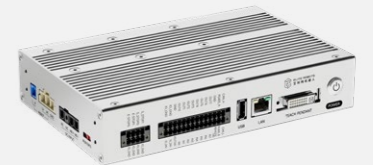
Optional OEM "Mini" DC controller for integrators, OEM partners and users who want to create their own custom design.