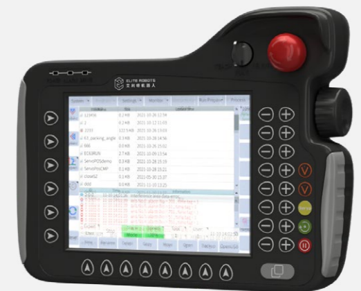
Industrial teach-pendant with 3-modes enable key for safe and convenient on-site operations. 8" touch-screen.