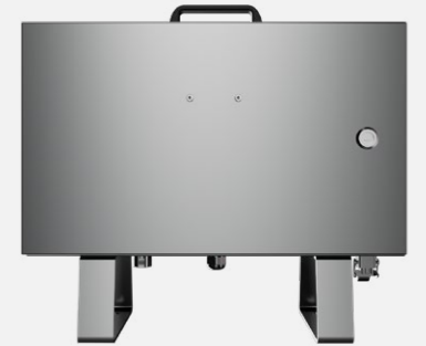
Standard AC/DC controller with 16 DI / 16 DO. Ethernet/IP / Profinet slave with Modbus TCP/RTU interface